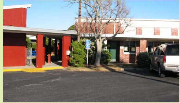
Accessible parking areas are signed but the pavement is unmarked

Recommendation: Provide pavement markings and include striping details to meet current ADA regulations (see Appendix H). Accessible parking should be located as close to the main building entrance as possible.