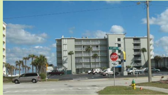
Sidewalk is located along the south side of Osceola Avenue

Recommendations: Review the possibility of providing a signal at the intersection of S.R. A1A and Osceola Avenue, especially if students live on the east side of S.R. A1A. The crosswalk should align with the sidewalk along the south side of Osceola Avenue.