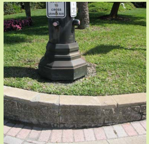
The push button signal at the southeast intersection of S.R. 40 and Halifax Drive is not accessible to all users

The push button signals on the southeast corner and the northwest corner of the intersection should be revised to comply with ADA.