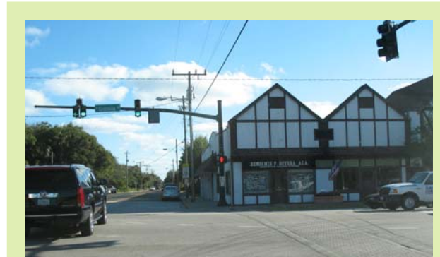
Halifax Drive looking south across S.R. 40

Findings: The walk zone for Osceola Elementary school extends north of S.R. 40 (Granada Boulevard). The crossing guard position at S.R. 40 and Halifax Drive has been closed due to budget reductions and the lack of students using this crossing. Students living north of S.R. 40 must now cross S.R. 40 unaided. The intersection is signalized with pedestrian features. Two of the four pedestrian push button signals may not be accessible for all users.