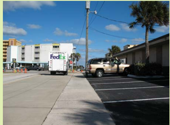
Pull-in parking reduces sidewalk safety along Vining Court

Recommendation: If possible, work with property owners to design alternative parking plans. Alternatively, provide paint markings to increase the visibility of the sidewalk and to increase awareness of the pedestrian zone.