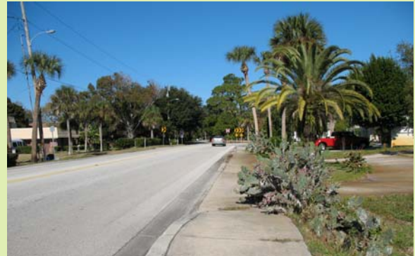
Cactus plants encroach into the sidewalk along the east side of Riverside Drive

Findings: The sidewalk along Halifax Drive is narrowed by vegetation encroachments in several areas. Vegetation overhangs the sidewalk in some areas.