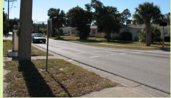
The crosswalk over Halifax Drive at Fluhart Drive is faded

Finding: Pull-in parking reduces safety for sidewalk users along the south side of Seminole Avenue and along Vining Court.