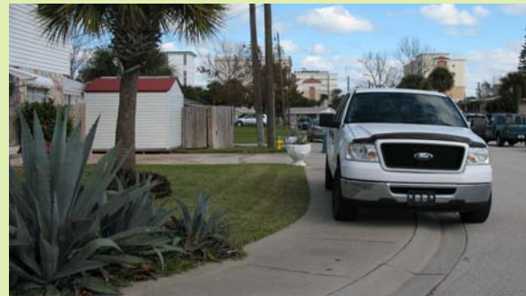
Motorists park along the sidewalk along the north side of Coquina Drive

Recommendation: The City of Ormond Beach should add “no stopping or parking” signs and increase enforcement. Sidewalks near schools should be curbed to reduce motorists’ encroachment.