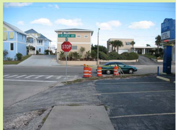
Pull-in parking reduces sidewalk safety along Seminole Avenue near S.R. A1A