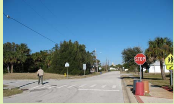
There is a one-directional stop sign along Coquina Drive at the intersection of Bosarvey Drive

Findings: The intersection of Coquina Drive and Bosarvey Drive includes a one – directional stop sign along Coquina Drive. Motorists and sidewalk users may expect a standard 3-way stop at this location. Recent budget reductions resulted in the closing of a crossing guard location at this intersection. The car line for the school often extends to this intersection and increases the potential for conflict between motorists and pedestrians and bicyclists. Additionally, the crosswalk over Bosarvey Drive is faded.