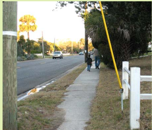
Vegetation and grass need to be trimmed along Halifax Drive to provide a clear walk zone

Recommendations: Increase maintenance along this sidewalk where needed. Trim overhead vegetation to provide a clear walk zone. If possible, paint bicycle lanes or provide painted shoulders along Halifax Drive to increase the buffer to the sidewalk and provide an alternate route for adult bicyclists.