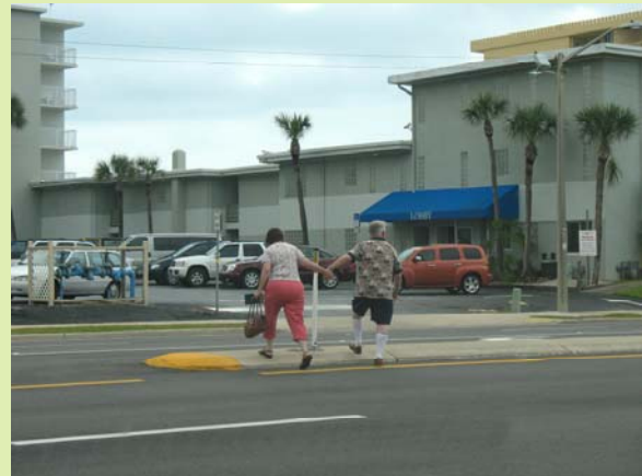
Pedestrians cross S.R. A1A at Osceola Avenue

Finding: The new curb ramp at the intersection of S.R. A1A and Osceola Avenue does not include an inside radius and sidewalk users, especially those in a wheelchair, may have difficulty maneuvering around the corner.