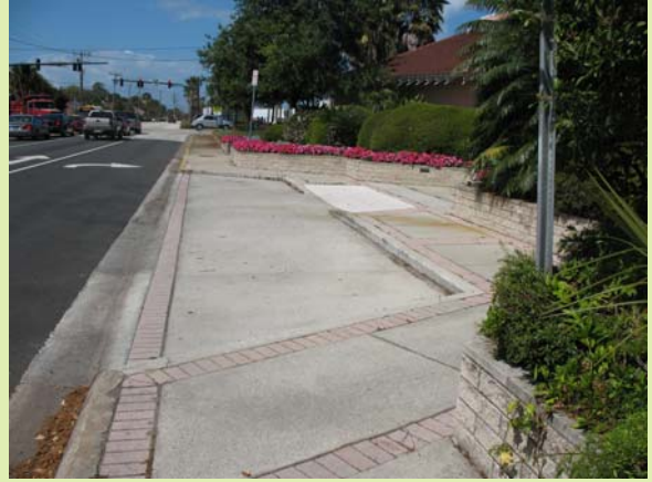
Curbing along the drop-off area of Ormond Memorial Gardens

Recommendations: The County may wish to work with the City of Ormond Beach to add curb ramps to allow through traffic on the sidewalk. As an interim measure, color the concrete surface within the drop-off area to distinguish the vehicular area from the sidewalk. Paint the curb yellow.