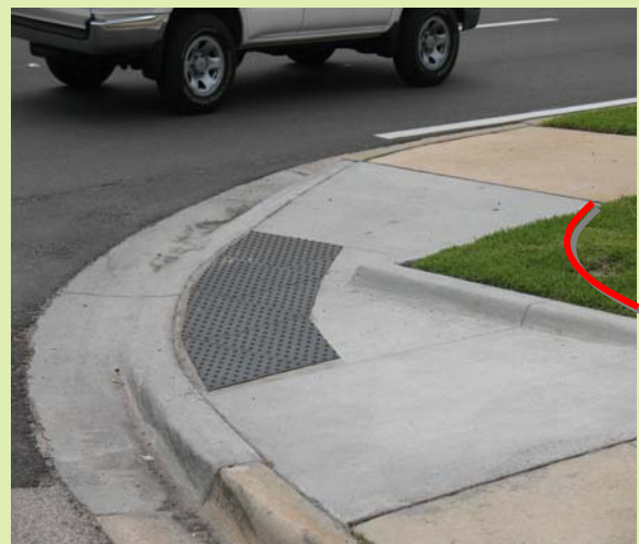
The new curb ramp at the intersection of S.R. A1A and Osceola Avenue does not include an inside radius

Recommendation: Reconstruct the sidewalk intersection to include an inside radius.