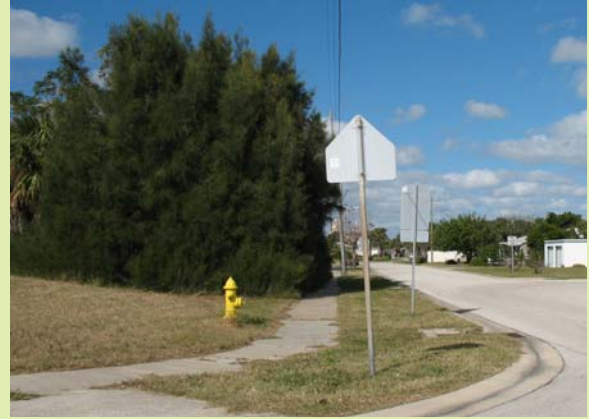
Vegetation encroaches into the sidewalk along Coquina Drive

Recommendation: The City may wish to notify property owners of the encroachments and request removal. The City should work with the property owners to trim back vegetation.