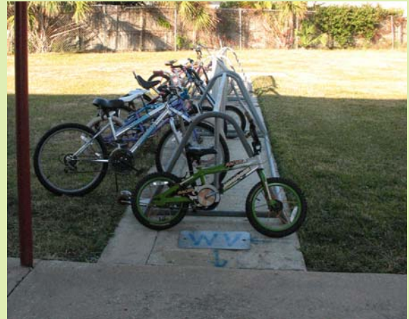
The concrete area for the bicycle rack is narrow

If funds allow, expand the concrete area at the existing bicycle rack to provide paved access.