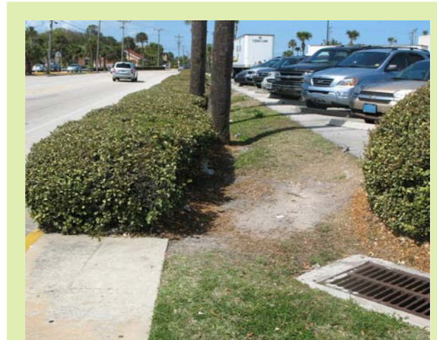
The east right of way on Halifax Drive north of S.R. 40

Recommendation: Construct a minimum 5' wide sidewalk on the east side of Halifax Drive from S.R. 40 to Amsden Road. Sidewalk construction from S.R. 40 to Wildwood Avenue is the most needed. This project is recommended as a Priority Project and is further detailed at the end of this chapter.