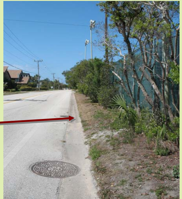
Right of way is restricted along Halifax Drive at the Oceanside Country Club