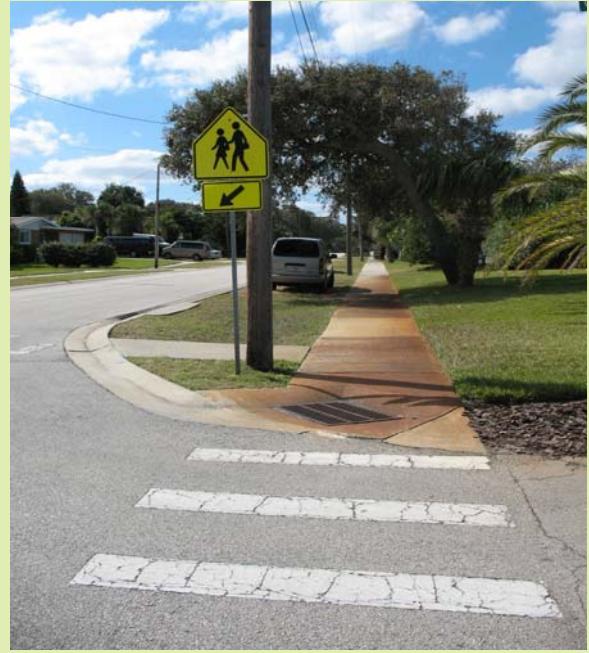
A drainage grate is located in a curb ramp at Carib Drive at Coquina Drive

Recommendation: If possible, relocate drainage grates away from the sidewalk and ramp areas.