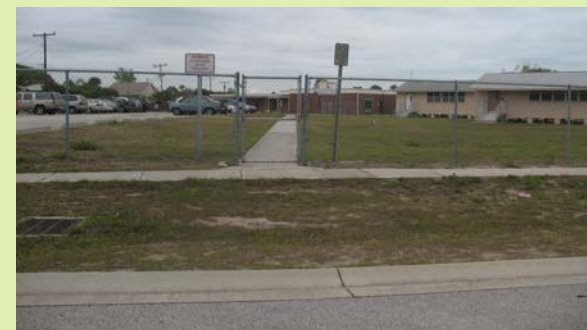
Campus sidewalk access is separated from vehicular traffic at the entrance from Seminole Avenue

Recommendation: Students should continue to be encouraged to use the sidewalk connection to reduce possible conflict with motorists.