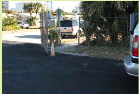
The sidewalk along the south side of Osceola Avenue terminates into the school parking area

Alternatively, when striping the parking lot, include a painted pedestrian zone connecting the sidewalk along Osceola Avenue to the main building entrance. The pedestrian area should be in front of any parked cars and separated from vehicles with bollards or curb stops.