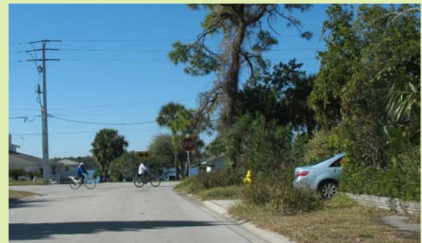
Rockefeller Drive & Riverside Drive

Recommendation: Construct a minimum 5 foot wide section of sidewalk (50 linear feet) from the existing sidewalk on the north side of Rockefeller Drive to the existing sidewalk along the east side of Riverside Drive.