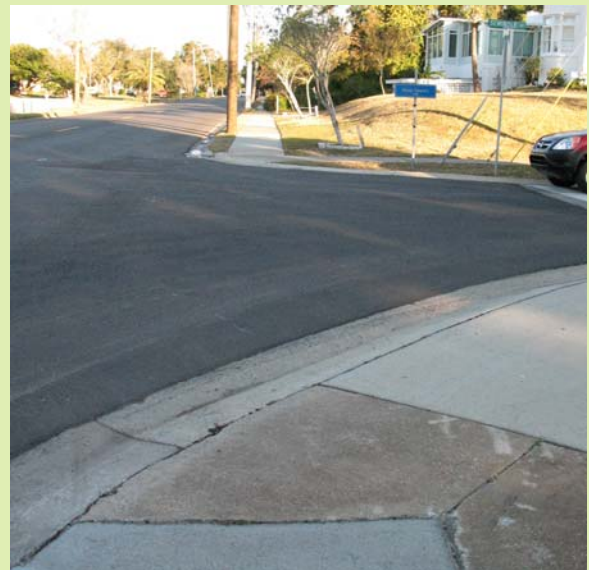
The crosswalk is missing over Seminole Avenue at Halifax Drive

Recommendation: If not completed with construction, add stop bars and crosswalks to intersections along Halifax Drive and to any other intersections within the walk zone.