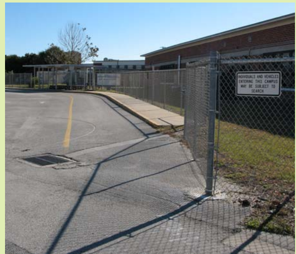
The sidewalk near the student drop-off and pick-up area does not connect to Coquina Drive

Recommendation: Construct the missing sidewalk connection to the Coquina Drive sidewalk.