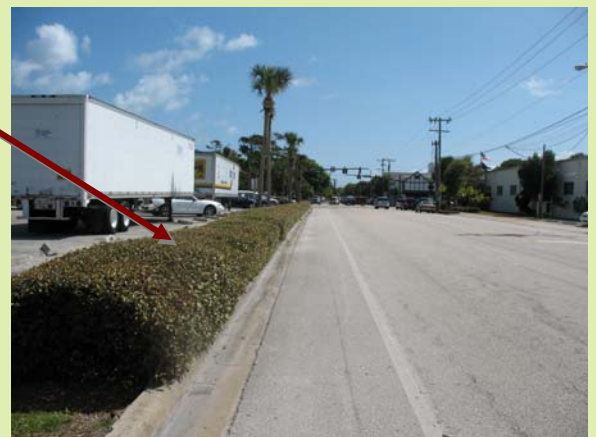
Halifax Drive looking south toward S.R. 40